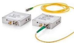
Programmable 2.5GHz RFoF units