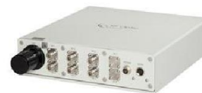
Outdoor Enclosure for RFoF